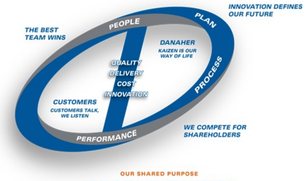
HELPING REALIZE LIFE'S POTENTIAL

Underpinned by these five Core Values as well as our Shared Purpose – Helping Realize Life's Potential , the DBS tools are organized into four pillars that are designed to apply to every aspect of our business: Growth, Lean, Leadership and the DBS Fundamentals.